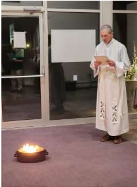
The new fire from the Easter Vigil.