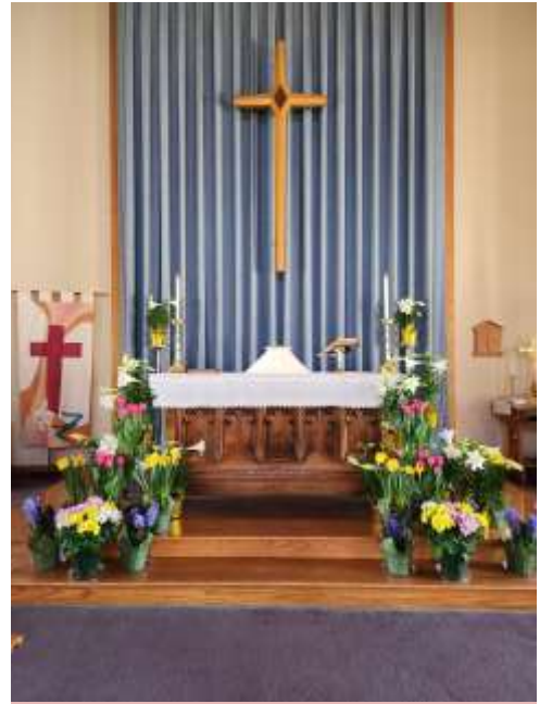
Easter flowers, they smelled and looked wonderful!