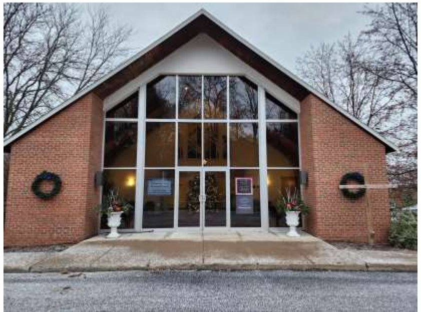
Photographs from last years Christmas Season.