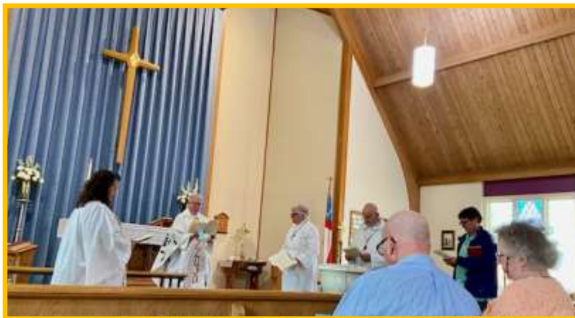
Good Shepherd Sunday Faithful Farewell Service April 30, 2023

The Baldwinsville Memorial Day Parade will be held on Tuesday, May 30, 2023