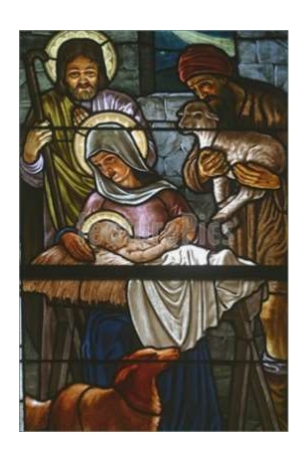
GRACE EPISCOPAL CHURCH BALDWINSVILLE, NY 7:00 p.m. DECEMBER 24, 2022