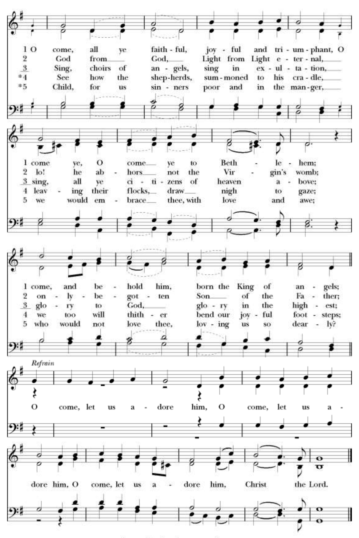
6 Yea, Lord, we greet thee, born this happy morning; Jesus, to thee be glory given; Word of the Father, now in flesh appearing;