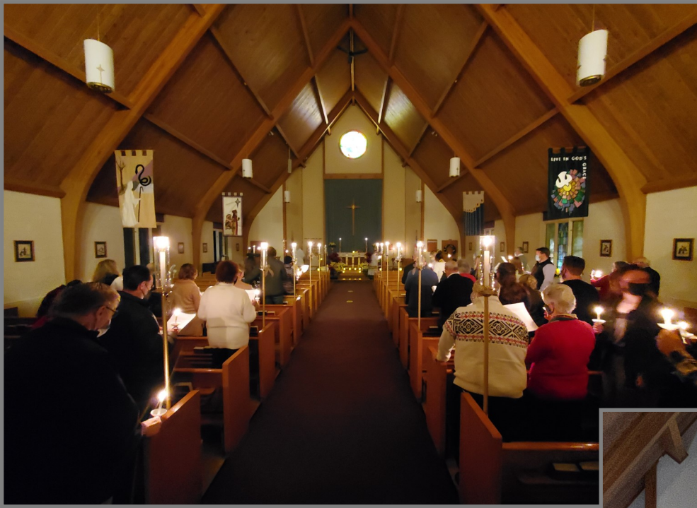
Above: Christmas Eve candlelight service.