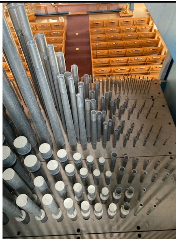
View from the organ pipes during tuning