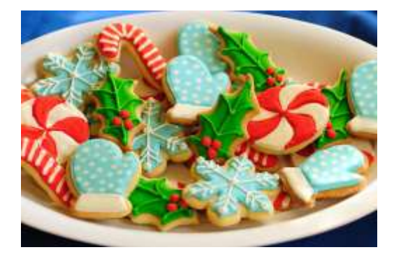
Cookie Walk December 1<sup>st</sup>