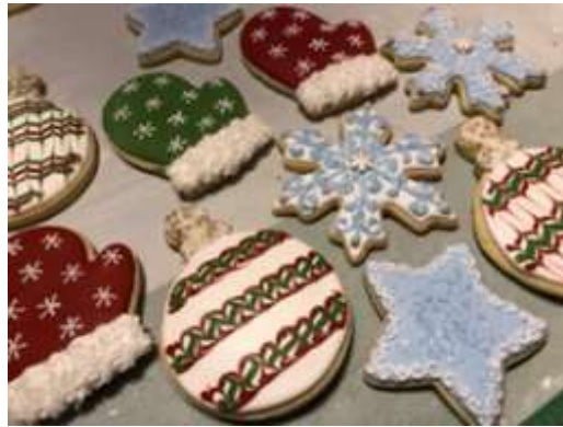
Cookie Walk December 1 st